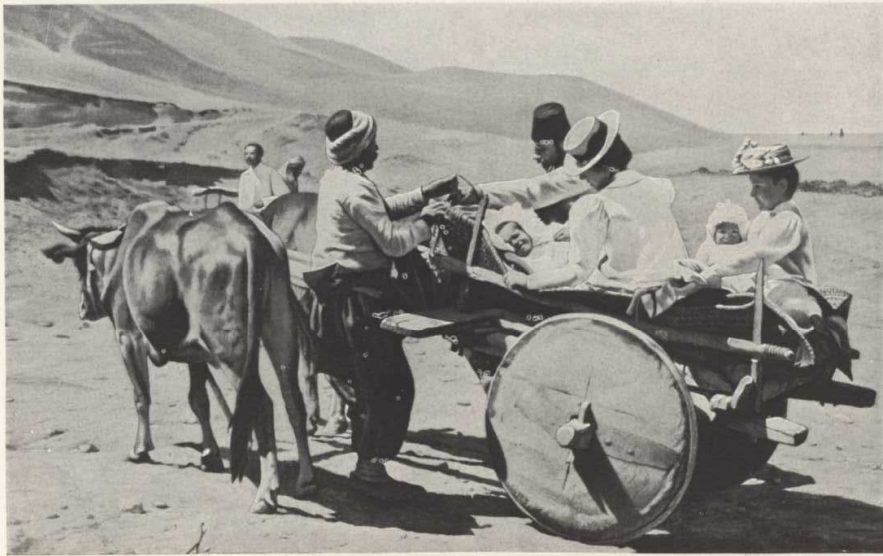
THE MOST COMMON VEHICLE IN ARMENIA

"Armenia is not easy to bound at any period of history, but, roughly, it is the tableland extending from the Caspian Sea nearly to the Mediterranean Sea. Its limits have become utterly fluid; the waves of conquering Persians and Byzantines, Arabs and Romans, Russians and Turks have flowed and ebbed on its shores until all lines are obliterated. Armenia now is not a State, not even a geographic unity, but merely a term for the region where the Armenians live" (see text, page 329; also map, page 359).