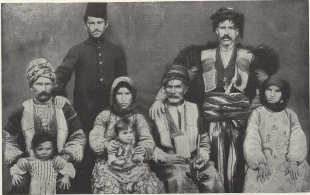
AN ARMENIAN FAMILY OF VAN

"Their appearance is definitely eastern; swarthy, heavy-haired, black-eyed, with aquiline features, they look more Oriental than Turk, Slav, or Greek. In general type they come closer to the Jews than to any other people, sharing with them the strongly marked features, prominent nose, and near-set eyes, as well as some gestures we think of as characteristically Jewish" (see text, page 334).