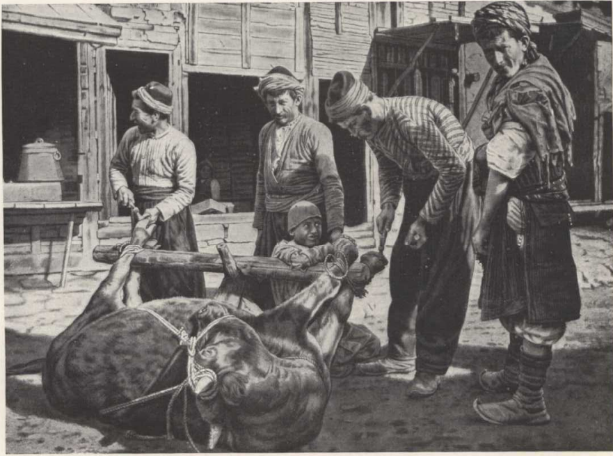
SHOEING AN OXEN ON THE VILLAGE MAIN STREET: VAN