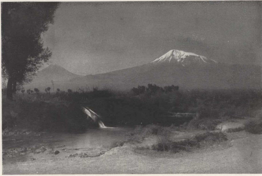
THE MOST FAMOUS OF MOUNTAINS, MOUNT ARARAT IN ARMENIA