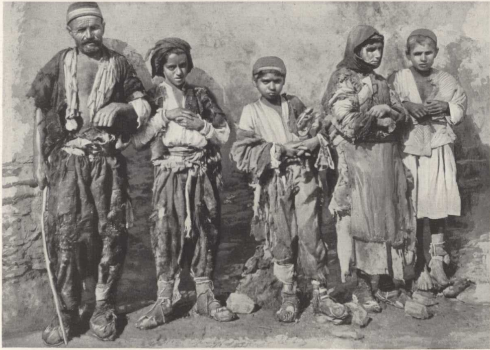
AN ELOQUENT PICTURE OF POVERTY IN ARMENIA