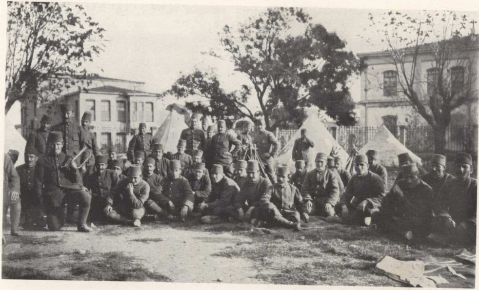
IN CONSTANTINOPLE ALL PARKS AND OPEN PLACES ARE NOW USED FOR THE MILITARY