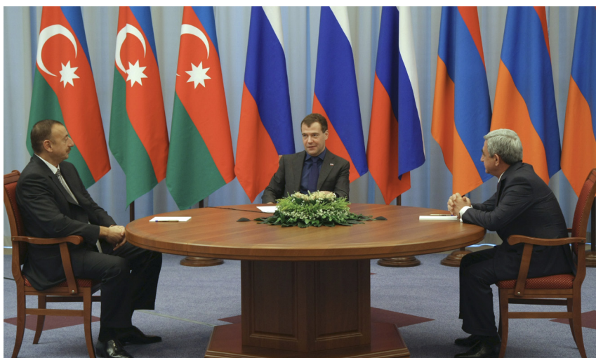
Russia's ambiguous mediation role: Dmitry Medvedev and the presidents of Azerbaijan and Armenia, Ilham Aliyev (left) and Serzh Sargsyan (right). Astrakhan, 27 October 2010.

The conflict over Nagorno-Karabakh (NK) between Armenia and Azerbaijan remains immune to a political solution despite the two decades of intensive international mediation. The parties to the conflict are using negotiations to buy time and maintain a fragile status quo, even if they find it unfavourable in the long run. The external actors either lack tangible interest in breaking the current political impasse or are unable to do so. The complexity of issues and geopolitical realities around the NK conflict render it intractable and make its resolution ever more challenging.